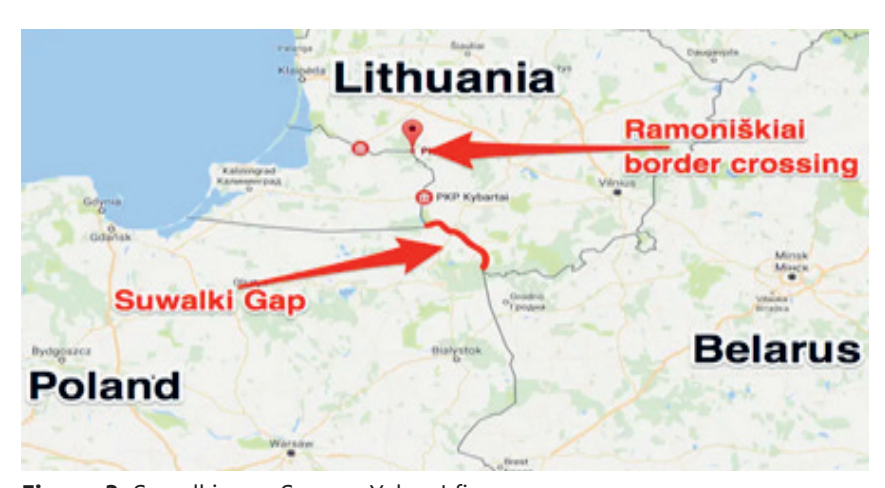
Figure 3. Suwalki gap.

The author of this paper presents information and maps of the border with the Russian Federation to enhance visual comprehension of the geographical terrain and identify vulnerable border areas that could be exploited for special operations targeting objects within Lithuania.