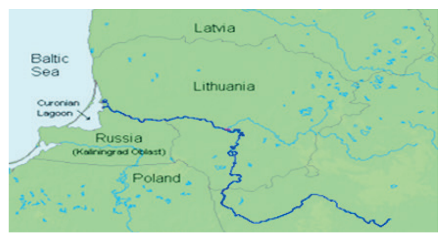
Figure 2. Neman river.