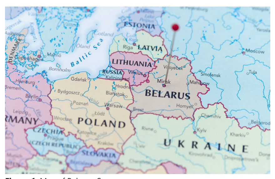
Figure 1. Map of Belarus.

The author of this paper has provided a visual representation of the locations of the Baltic States, the Russian Federation and the Republic of Belorussia on the map below. This will offer a better view and understanding of why Russia seeks to keep the Baltic States within its sphere of influence or in other words, in the backyard of the Russian Federation as the successor must be undisputable after the dissolution of the Soviet Union.